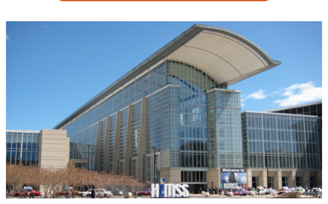
Chicago a Top Choice for Convention Planners

Chicago is a great destination for group travel—especially if that group can fill a whole convention hall. According to a new survey conducted by the research firm STR, Chicago tied with Orlando, Florida as the top destination to host a conference or convention of 1,000-plus attendees. Those surveyed cited the city's cleanliness, ease of access, and safe environment-all strong assets of Chicago's main convention center, McCormick Place, as well as other venues throughout the city.